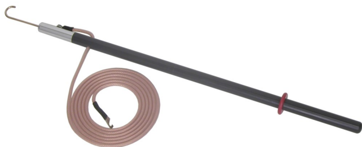
ES30 Earthing stick

Note: Due to the company's continuous research programme, the information above may change at any time without prior notification. Please check that you have the most recent data on the product.